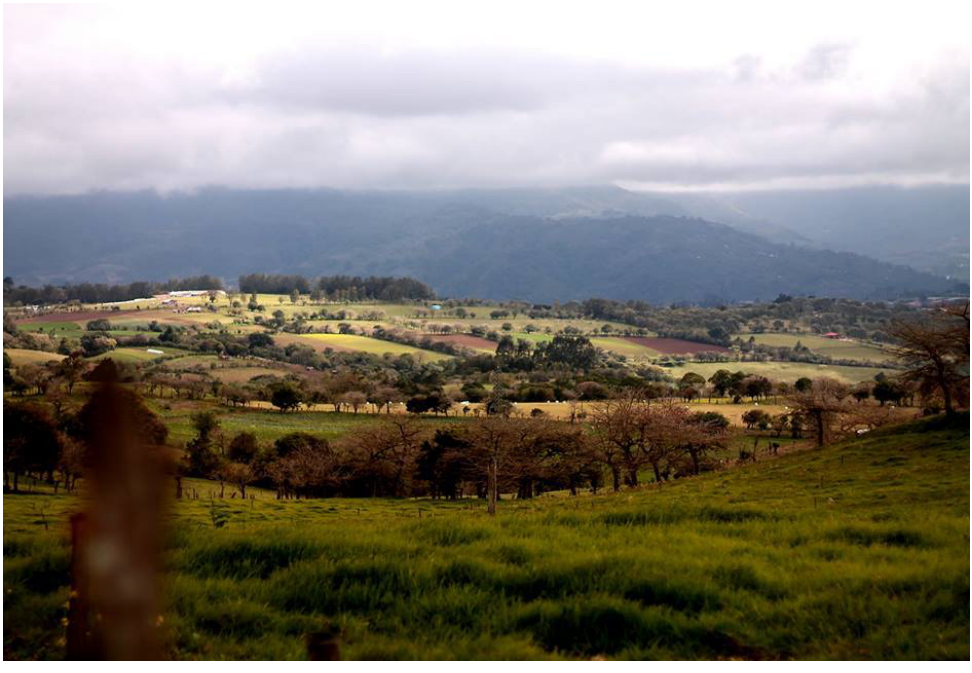
Central Valley in Costa Rica

and Nicaraguans I came to know and love. Despite my own shortcomings, often due to an inherent North America ego and entailing assumptions, I was showered with grace each day and welcomed into their homes as a family or close friend. I had to learn how to be vulnerable, to be able to rely on the generosity and service of others. This was not an easy thing to do, especially being from a North American culture that bombards us every day with the message that vulnerability is an unwanted and unfortunate thing. On the contrary, through this forced vulnerability I was able to experience much through a lens I would not otherwise have had access to. In this I had the joy of witnessing alternative ways of living and through this was challenged in my own faith, habits, and convictions,