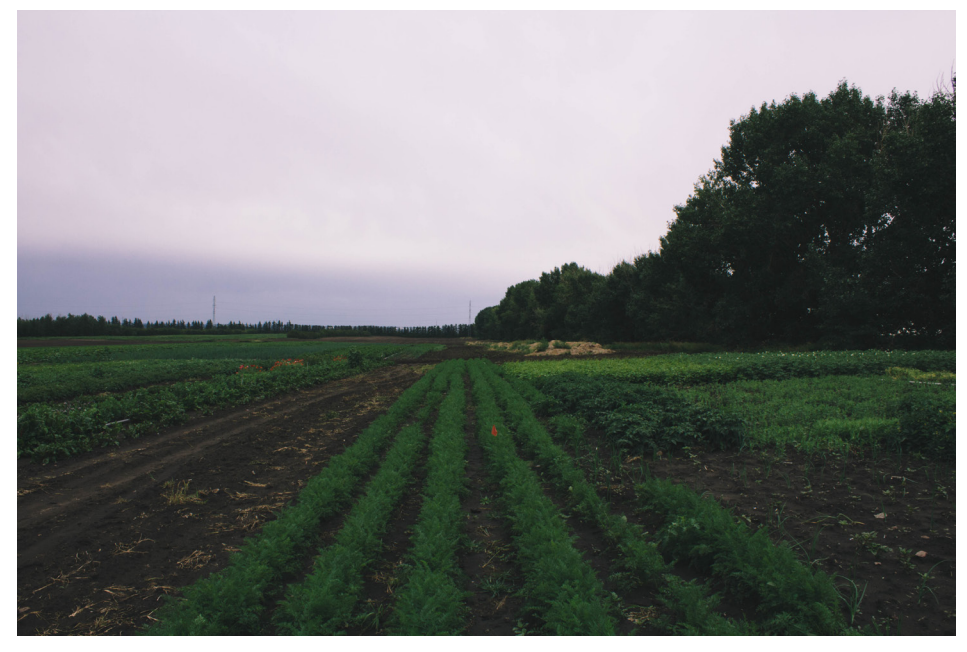
View at Lady Flower Gardens

Lady Flower Gardens is a place where students can experience hands-on the importance of community development and sustainable agricultural practices. As the vision and scope of the garden grows, it continues to draw in students from King's. Students from the Environmental Studies department at King's have previously taken learning trips to the garden. This fall, students in the ENVS 491 Internship Reflection class will conduct research at the garden. King's faculty plan on furthering this involvement as needs and interest present themselves.