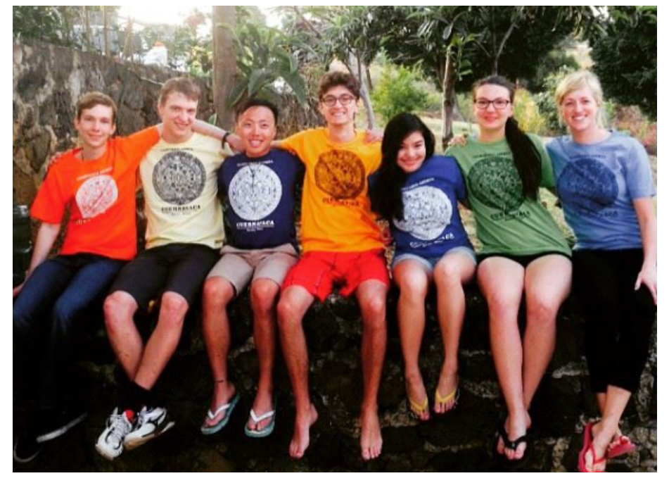
The Quest Mexico team

The King's group returned from Mexico exhausted, saturated with information and emotion, but also inspired, knowing that even when the way forward seems foggy, there is still a plan for action. The challenge now lies in preventing this experience from growing stagnant, and allowing it to manifest and flourish through informed action.